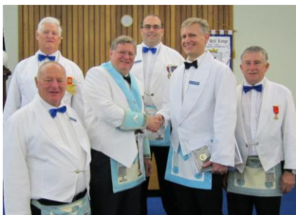
Camp Hill Lodge