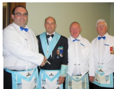
Theodore Unmack Lodge