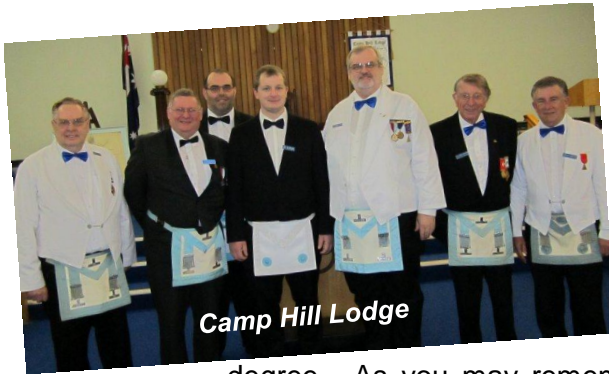
Camp Hill Lodge