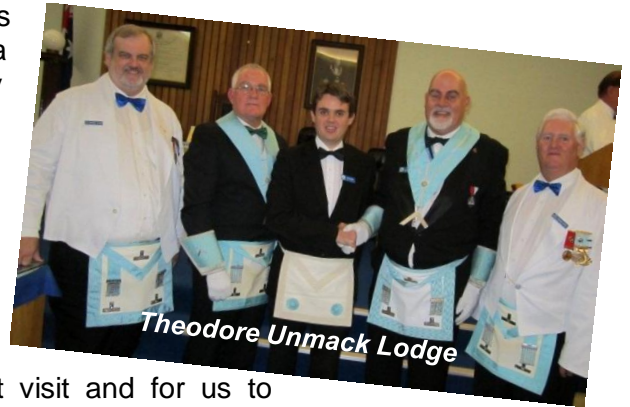
Theodore Unmack Lodge