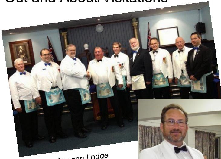
City of Logan Lodge emulation 1st degree.